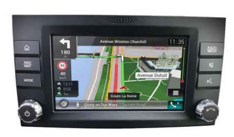
AUDIO 40 (Pioneer)

Mercedes Vito - Audio30 (Garmin) Mercedes Vito - Audio40 (Garmin) (Not compatible with Pioneer head-units)