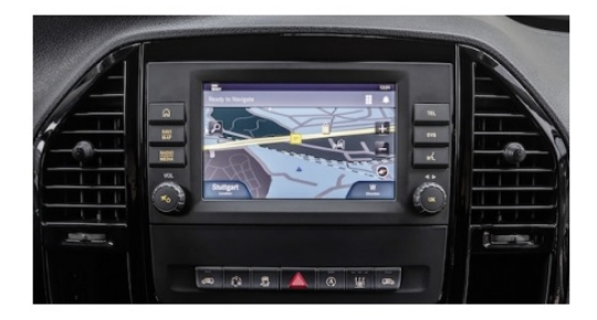
AUDIO 30 (Garmin)