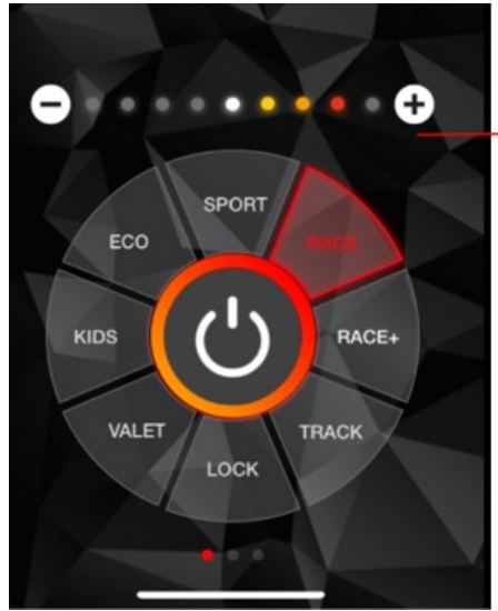
Profile fine adjustment

The seven driving profiles of the PARDUS PRO 3.0 Power Pedal can also be modified with 4+ and 4- fine tuning levels.