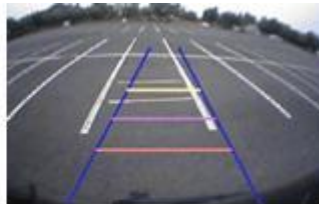
Ajustable guide lines