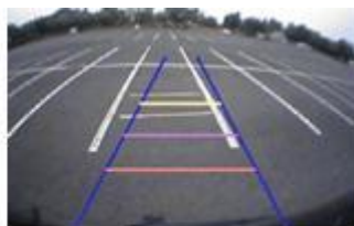
Ajustable guide lines