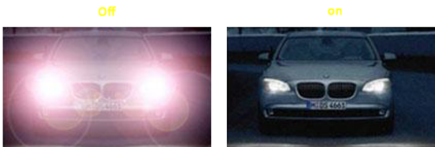
Back Light Compensation

The camera runs on intelligent software. As a result the appearance of a bright background or lamps in the camera image is automatically corrected.