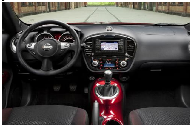
Qashqai 2 2010