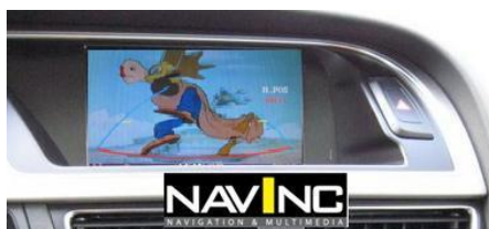
Touch remote buttons

Control of the connected Audio/Video source via touch screen. Remote control buttons will be programmed on the screen via touch screen foil. Via the touch screen foil the connected Audio/Video sources can be controlled without making use of an external remote control.