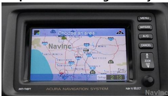
Image of suitable navigation systems: 12-pins Acura navigation system