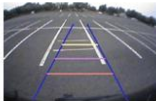
Ajustable guide lines