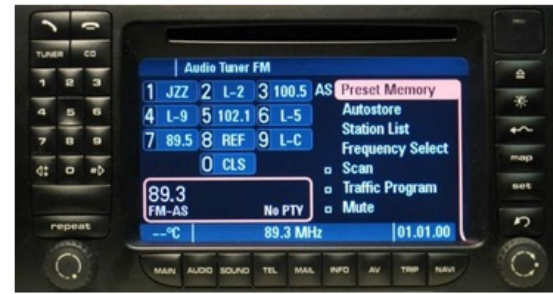
PCM 2.0 - BE6654