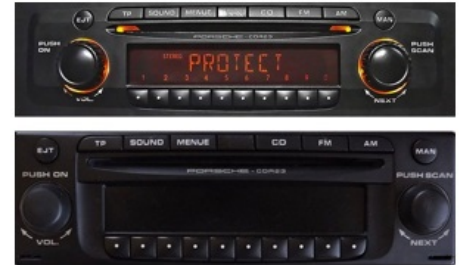
CDR23 - all versions