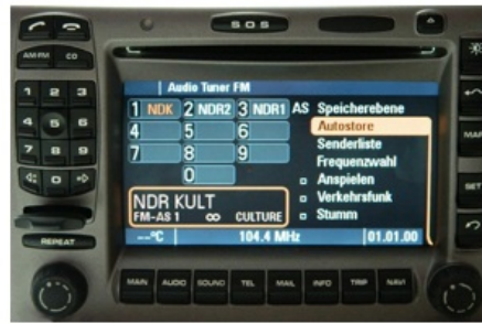
PCM 2.0 - BE6642