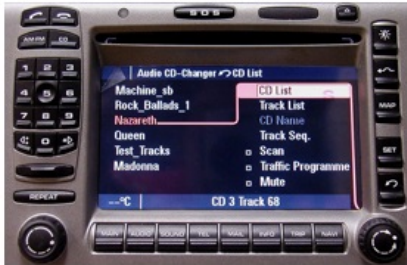
PCM 2.1 - BE6692