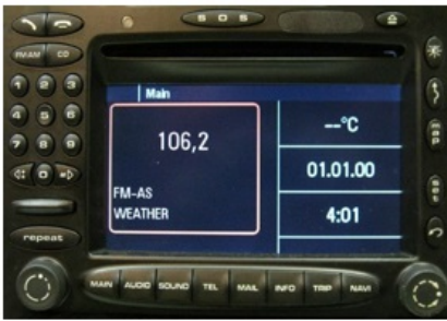
PCM 2.0 - BE6632