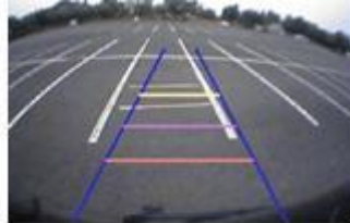
Ajustable guide lines