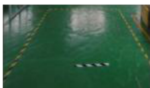
Image distortion correction

The camera runs on intelligent software. As a result the unwanted bulging in