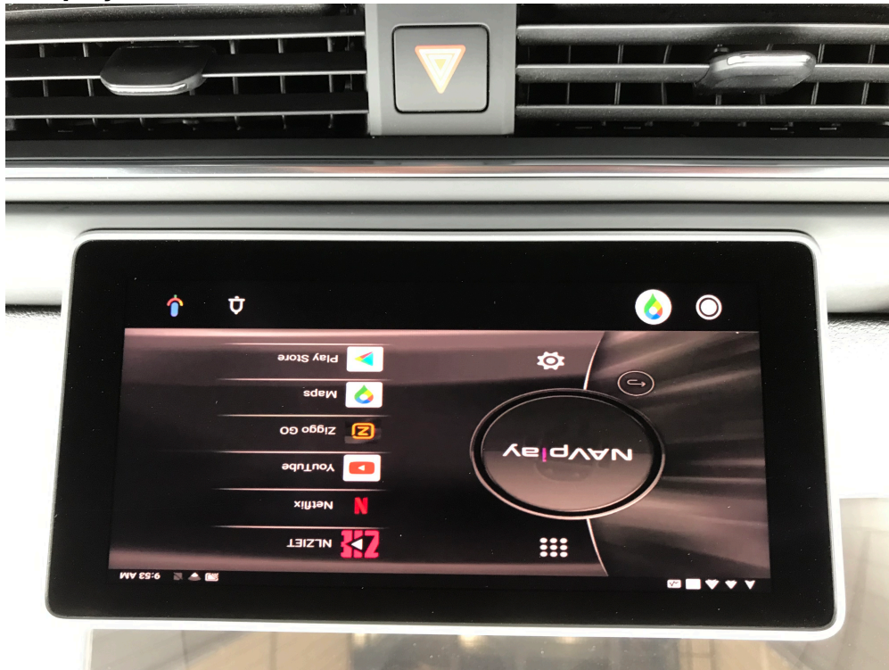
NAVplay AUTO - split screen option