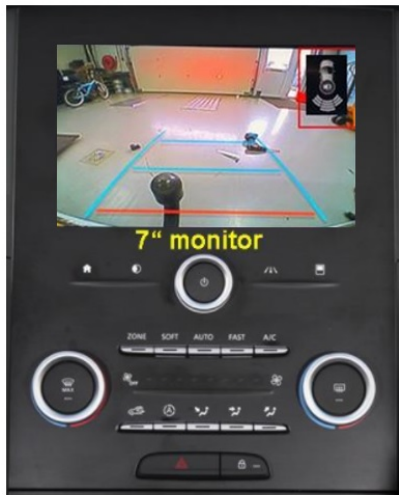
Rlink2 – 7.0"