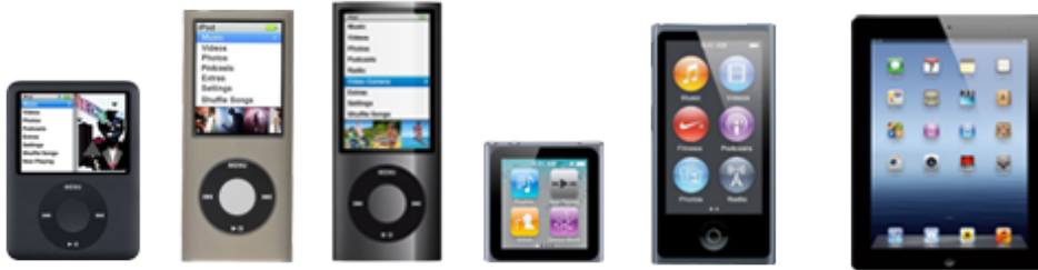
Nano 3G Nano 4G Nano 5G Nano 6G Nano 7G iPad 1/2/3