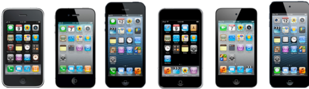
iPhone 3G/3GS iPhone 4G/4GS iPhone 5 Touch 2G/3G Touch 4G Touch 5G